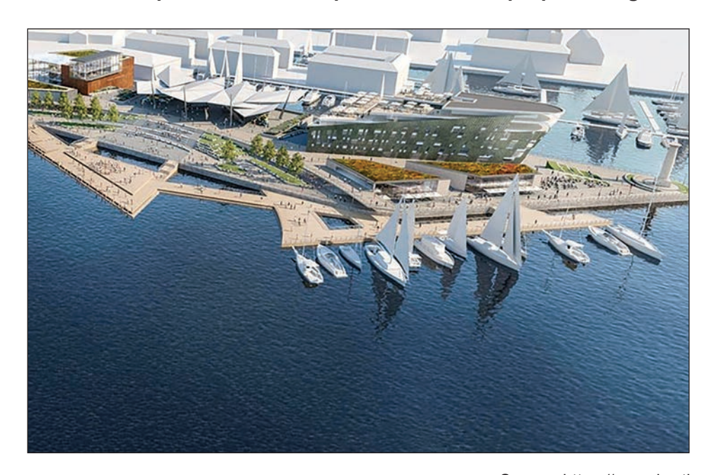
Figure 2b: Artist's impression of Hartlepool Marina after proposed regeneration