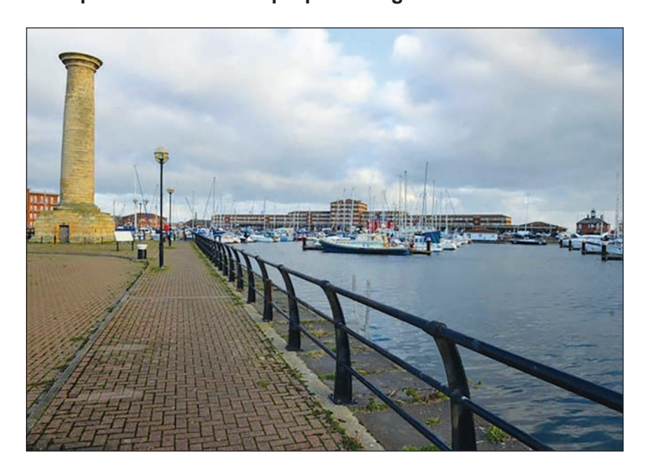
Figure 2a: Hartlepool Marina before proposed regeneration