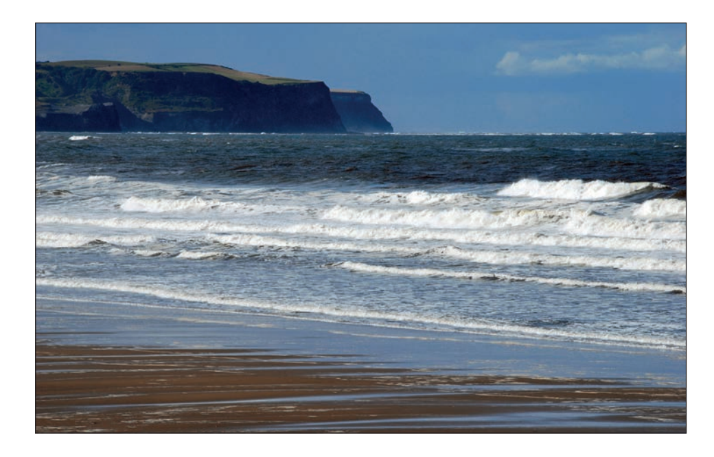
Figure 6: Beach at Whitby, North Yorkshire

For their fieldwork enquiry, a group of AS level Geography students chose to investigate the topic of wave characteristics at Whitby, North Yorkshire (Figure 6) .