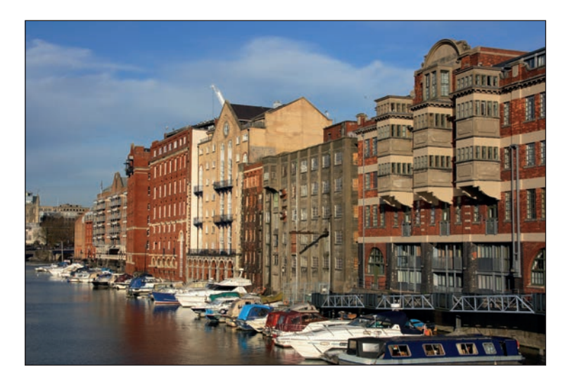
Figure 4: Gentrification in Redcliffe, Bristol

For their fieldwork enquiry, a group of AS level Geography students chose to investigate the impact of gentrification in Redcliffe, an inner-city area in Bristol (Figure 4).