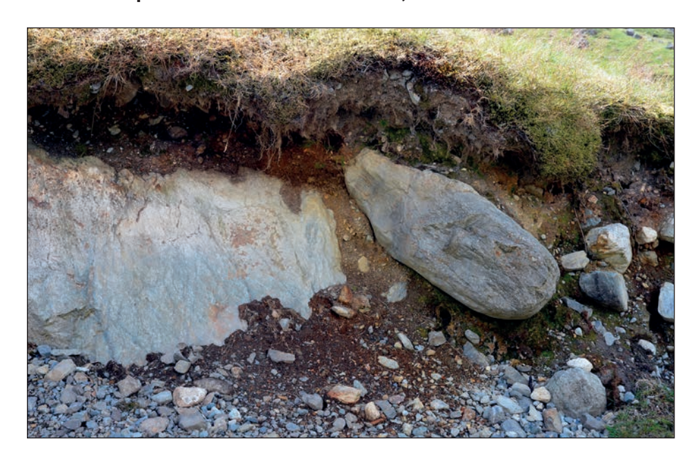
Figure 8: Glacial deposits at Levers Water Tarn, Cumbria

For their fieldwork enquiry, a group of AS level Geography students chose to investigate the characteristics of glacial deposits at Levers Water Tarn, Cumbria (Figure 8) .